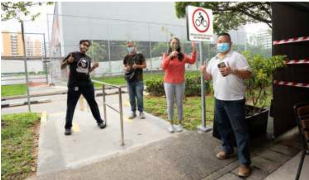
Delivery is made more convenient now with the new ramp

A multi-agency taskforce led by MP Carrie Tan has put in new infrastructure near Khatib Central's McDonald's, which will enhance the convenience and safety for delivery riders and pedestrians alike.