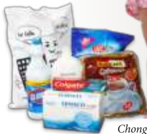
Chong Pang – Minister K Shanmugam gives out a goodie bag filled with essential items

Across all five divisions, our MPs led the distribution of goodie bags and cakes to our cleaners during the Christmas period to thank them for their contribution. The goodie bags, which consist of toiletries, masks, dried foods and other necessary daily household items, were prepared by a resident, her family and friends.