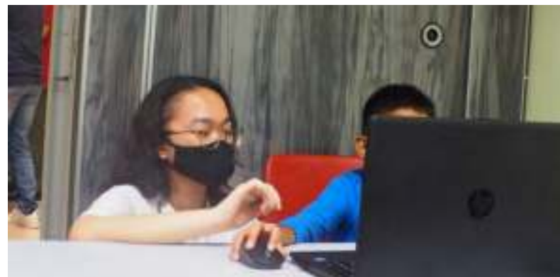
A volunteer helps a student with his learning modules

A dedicated online platform allows students to access learning materials at any time. Every Thursday evening, grassroots volunteers at Yishun Flora Residents' Corner (RC) welcome students who need extra guidance or are looking for a conducive learning environment.