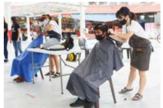
Volunteer barbers provide free haircuts while adhering to safe distancing measures

Thank you to all our community partners who helped make these events possible. We hope that these gestures will encourage the town council cleaners in the ongoing fight against COVID-19.