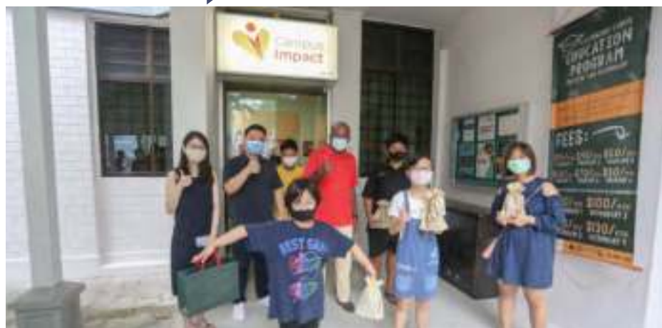
Students of different levels are overjoyed to receive stationery packs distributed by Minister K Shanmugam

For many working parents, CampusImpact provides peace of mind. The social organisation operates an unusual after school centre at Block 151 Yishun St 11 for young people between the ages of 7 to 17.