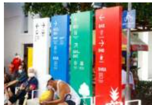
Different-coloured directional signages and more resting places

Sebagai bandar ‘mesra demensia’ yang pertama di Singapura, Nee Soon juga menawarkan perkhidmatan dan ciri-ciri yang lain seperti ‘Dementia Go-To Points’ untuk menjadikan komuniti tersebut lebih mesra bagi pesakit demensia.