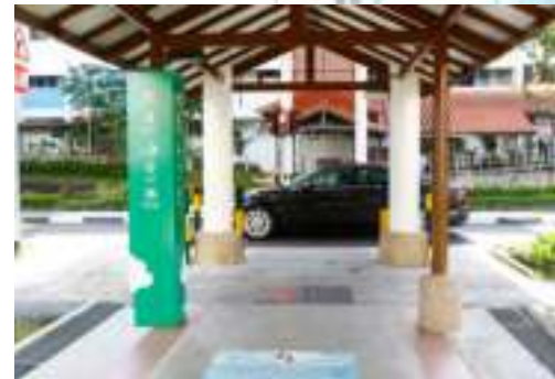
Directional signage on pillars along a covered walkway