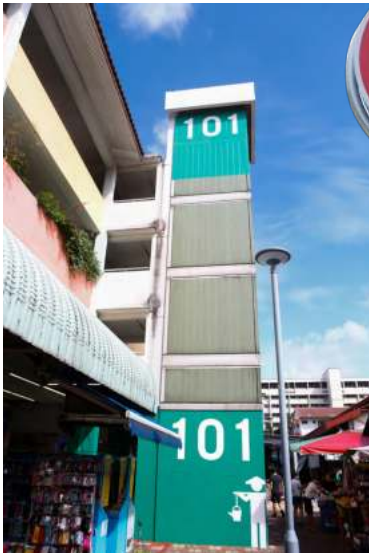
The green icon and large block number help older folks navigate the marketplace

Projek ini merupakan hasil kerjasama antara Pertubuhan Akar Umbi Nee Soon South, Agensi Penjagaan Bersepadu, Majlis Perbandaran Nee Soon, KTPH dan GoodLife! @ Yishun. Ia bertujuan menyediakan satu persekitaran yang lebih inklusif dan menyokong bagi pesakit demensia dan pengasuh mereka.